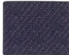
7044 Desert Night