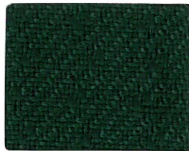
7034 Douglas Fur