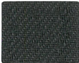
7047 Calcine Grey