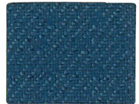
7005 Bright Blue